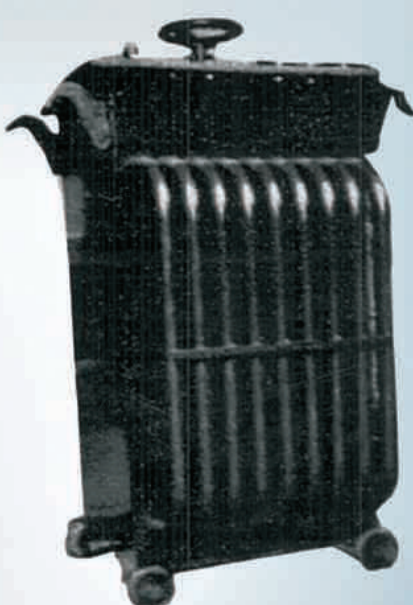
Variable Auto-Transformer Unit