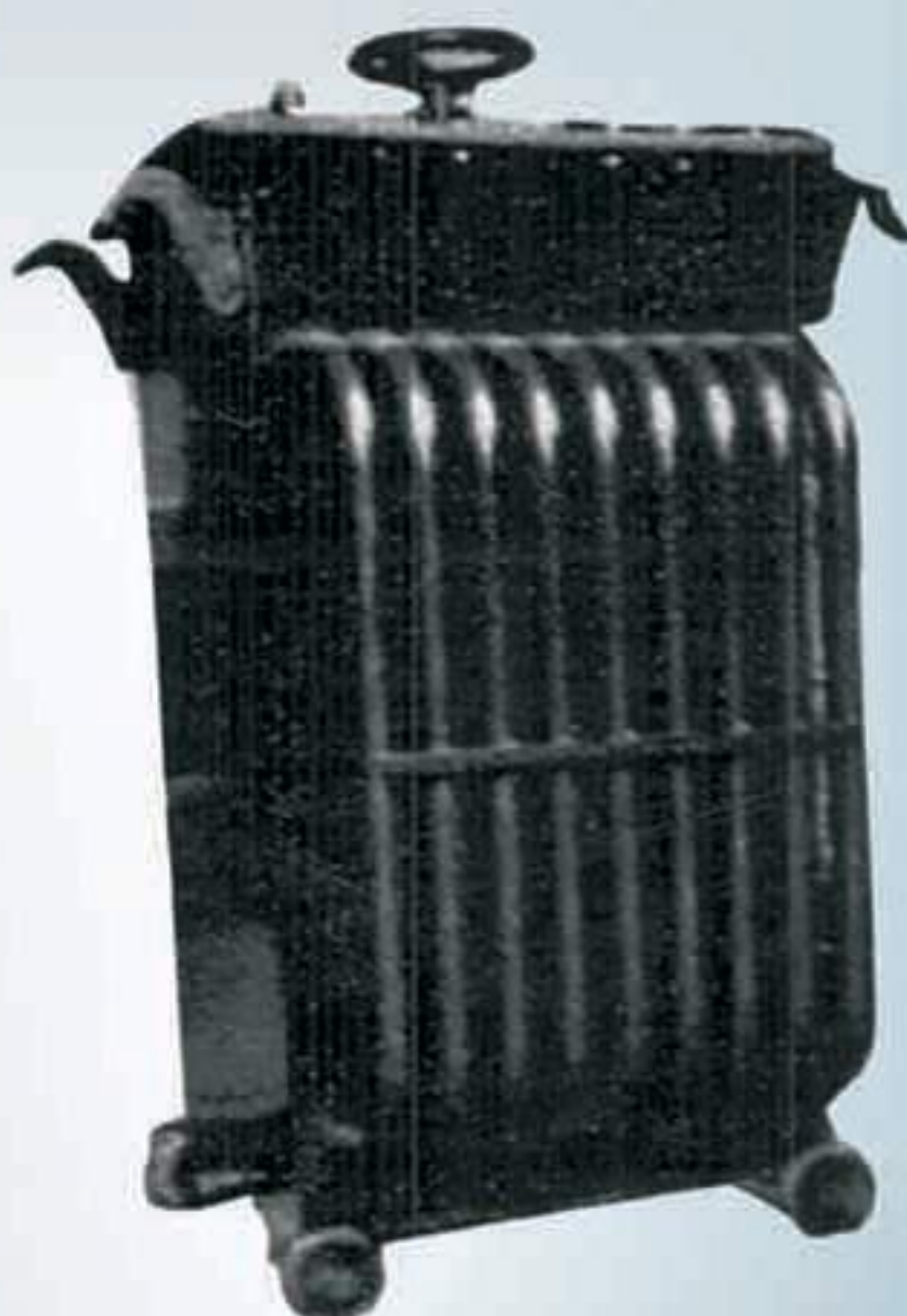
Variable Auto-Transformer Unit