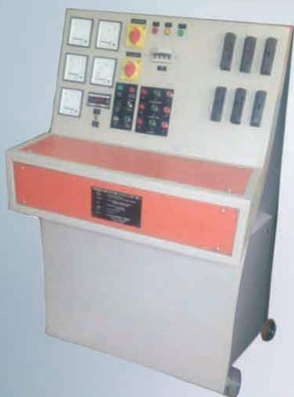
Control & Loading Transformer Unit